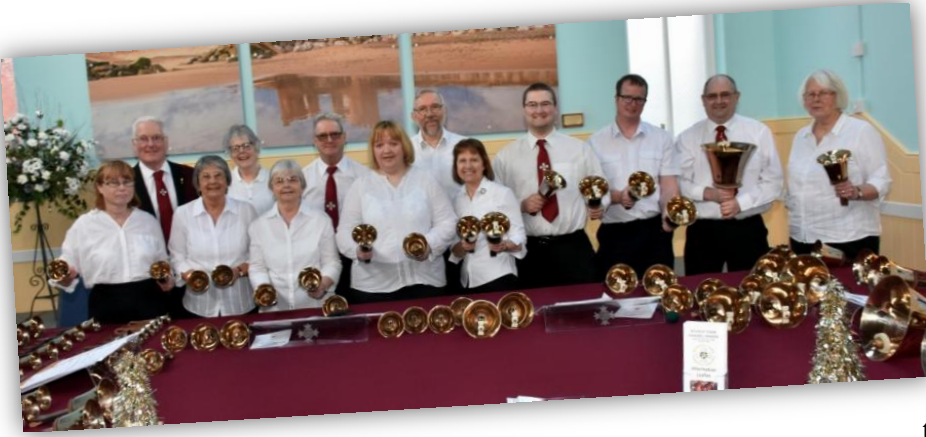
Luda group. As we are at the University - What's in a Name?

On the 'fifth gig' of Christmas (7 December) we had our own 'five gold rings' with the five octave full team entertaining the North Ferriby WI.